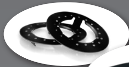
NU-LOK PISTON CUSHION