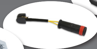
ELECTRONIC WEAR SENSORS