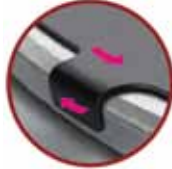
"Finger" torques under load, allowing plate to move during braking without stressing shim material or attachment