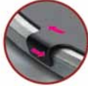
Torque load on finger shifts shim back to neutral position