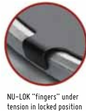
NU-LOK "fingers" under tension in locked position